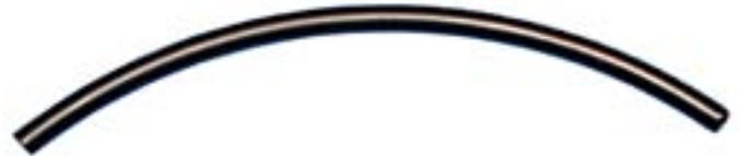
3/8 Black Poly Tube 4.0" L