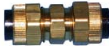
3/8 Poly Tube Union