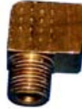
90° Street Elbow 1/8 NPT