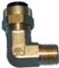
Male Elbow, 3/8" Poly To 1/8 NPT Male