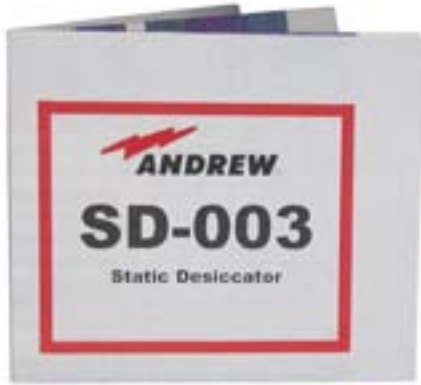
SD-003 Static Desiccator