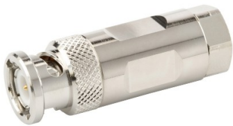
BNC Male for 1/4 in FSJ1-50A cable