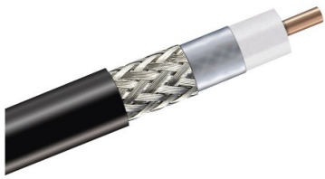
CNT-400, CNT® 50 Ohm Braided Coaxial Cable, variable, black PE jacket