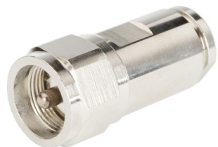
UHF Male for CNT-400 braided cable