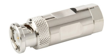
BNC Male for 1/4 in FSJ1-50A cable