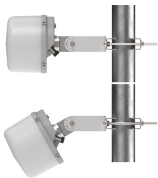
2-port Venue Antenna, 1710-2690 MHz, 40° HPBW, Fixed Tilt