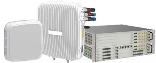
ERA head-end node and access points

AIMOS provides automated support with robust fault, configuration and inventory management capabilities, saving time and money for otherwise manual tasks. It integrates with third-party systems that use SNMP and data interchange formats such as SOAP and XML. AIMOS is available via software license or software as a service (SaaS).